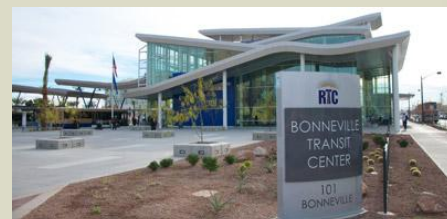
Bonneville Transit Center