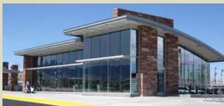
Transit Center Example (Centennial Transit Park & Ride)